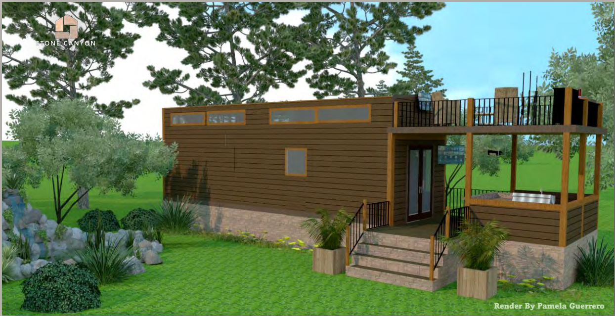
Render By Pamela Guerrero